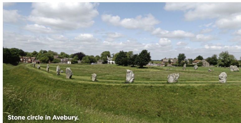
Stone circle in Avebury.

Walk ahead across hilltop, passing several barrows, before dropping down far side of Windmill Hill to gate and track. Turn L and, just before track emerges from clump of trees in 150m, turn L and follow track uphill and across open country for 1.2km to junction by barns. Turn L and, in 300m, at junction just past Bray Cottage, keep ahead along cul-de-sac lane. In 350m, where lane ends, keep ahead on tarmac path back to bridge over the infant Kennet passed earlier. Keep ahead along path back to Avebury churchyard, bear R across to churchyard gate and then L along the High Street in Avebury. In 100m, opposite red-brick cottages turn R along path to NT car park. CW