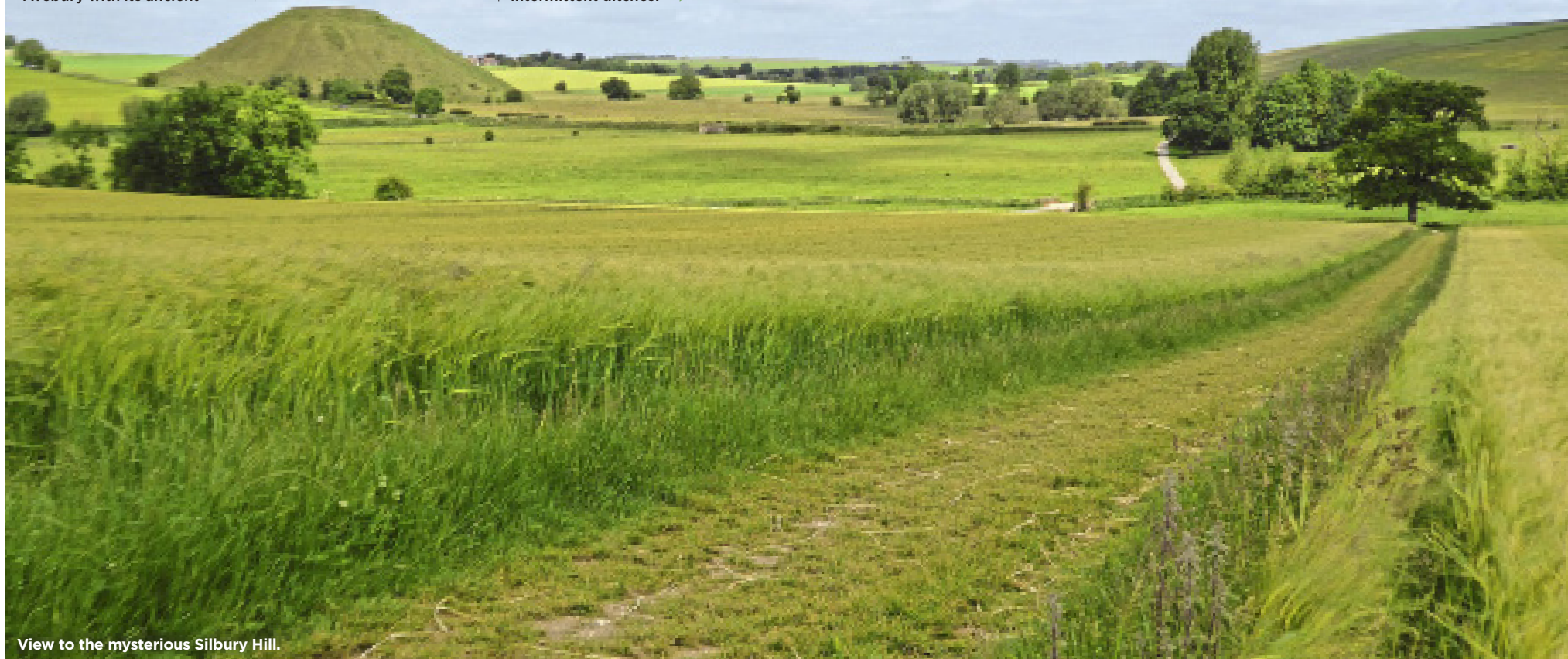
View to the mysterious Silbury Hill.

along the stone-lined Avenue. Suitably refreshed at either the Red Lion or Circles Restaurant, the second loop leads onto Windmill Hill, a classic example of a Neolithic causewayed enclosure, with three concentric but intermittent ditches. ➡