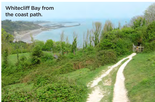
Whitecliff Bay from the coast path.