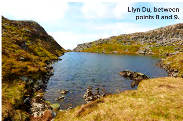
Llyn Du, between points 8 and 9.