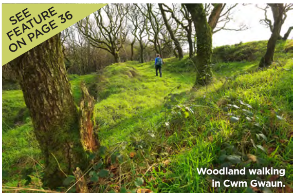
Woodland walking in Cwm Gwaun.