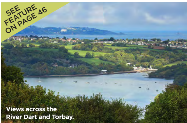
Views across the River Dart and Torbay.