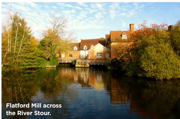
Flatford Mill across the River Stour.

▶ Distance: 7¼ miles/11.65km ▶ Time: 3½ hours ▶ Grade: Moderate