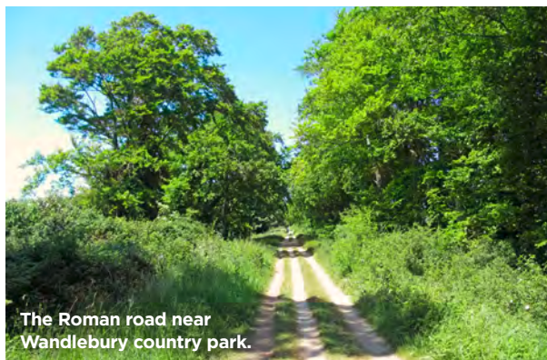
The Roman road near Wandlebury country park.