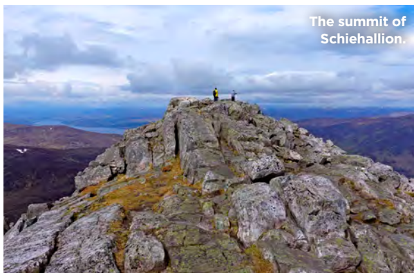
The summit of Schiehallion.