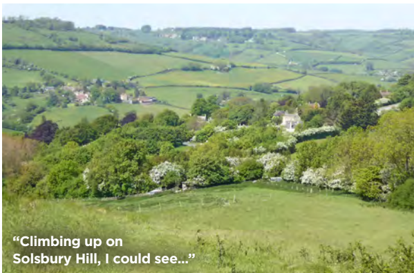
"Climbing up on Solsbury Hill, I could see..."

▶ Distance: 3 miles/4.8km ▶ Time: 2 hours ▶ Grade: Easy