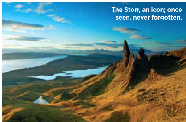
The Storr, an icon; once seen, never forgotten.