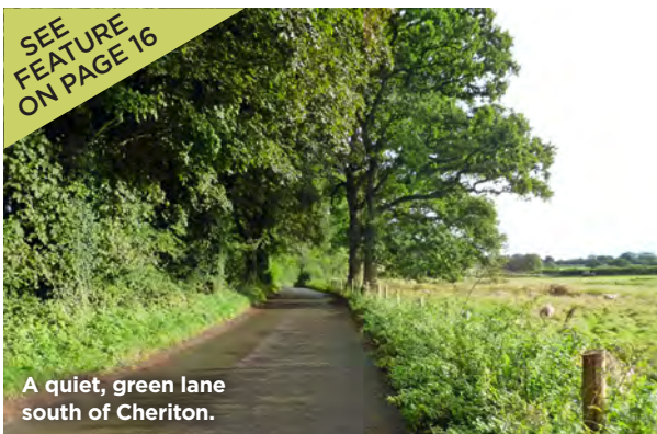
A quiet, green lane south of Cheriton.