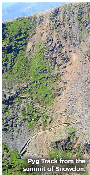
Pyg Track from the summit of Snowdon.