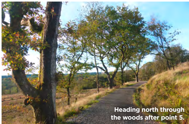
Heading north through the woods after point 5.

▶ Distance: 6½ miles/10.3km ▶ Time: 4 hours ▶ Grade: Moderate