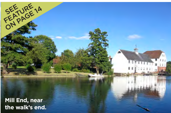
Mill End, near the walk's end.