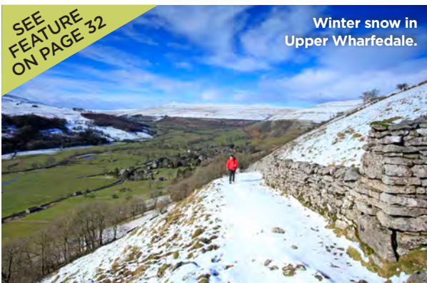
Winter snow in Upper Wharfedale.