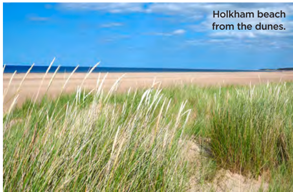
Holkham beach from the dunes.