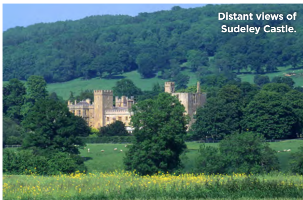
Distant views of Sudeley Castle.