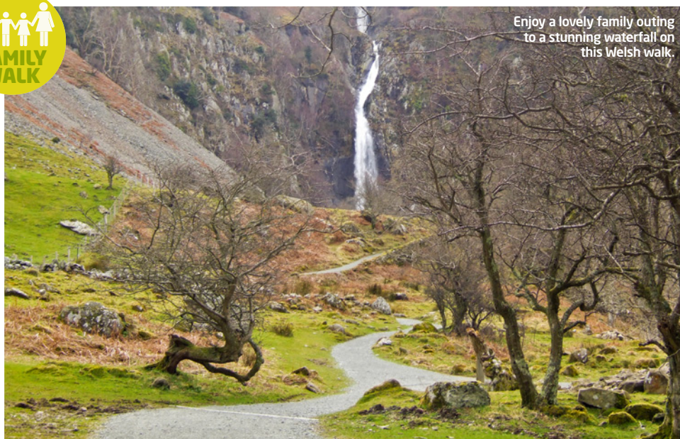
Enjoy a lovely family outing to a stunning waterfall on this Welsh walk.