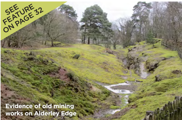
Evidence of old mining works on Alderley Edge