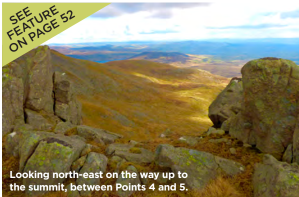
Looking north-east on the way up to the summit, between Points 4 and 5.