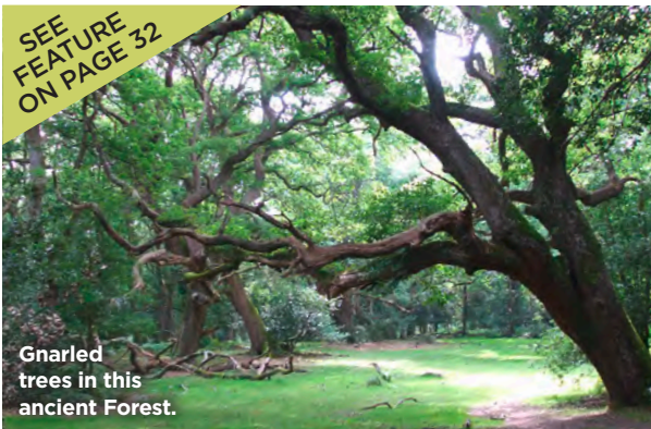
Gnarled trees in this ancient Forest.