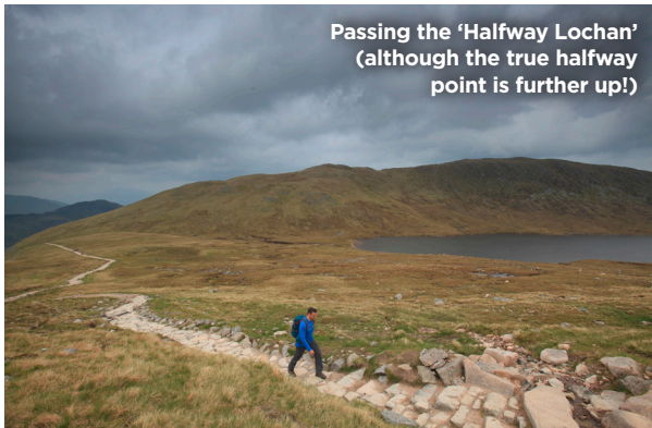
Passing the 'Halfway Lochan' (although the true halfway point is further up!)