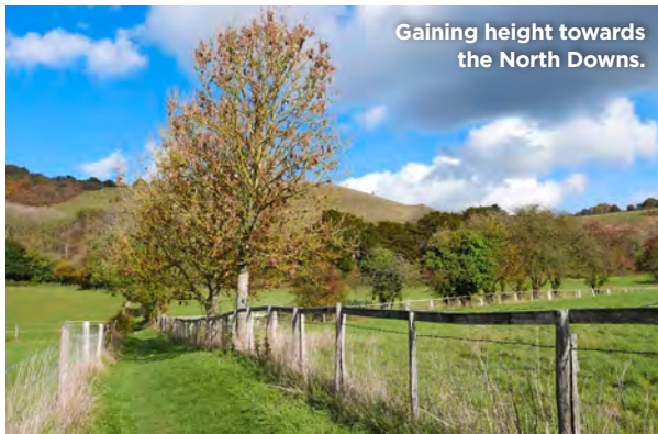
Gaining height towards the North Downs.