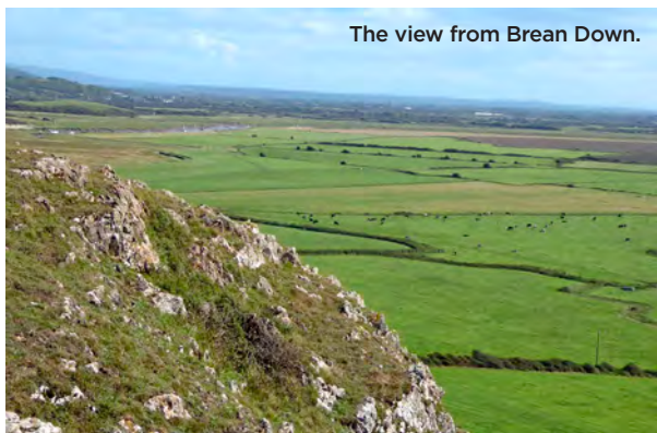
The view from Brean Down.

▶ Distance: 5 miles/8km ▶ Time: 2½ hours ▶ Grade: Moderate