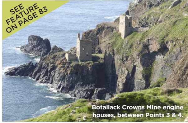
Botallack Crowns Mine engine houses, between Points 3 & 4.