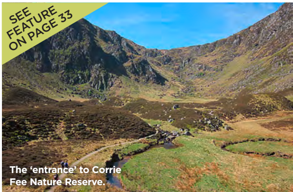
The 'entrance' to Corrie Fee Nature Reserve.