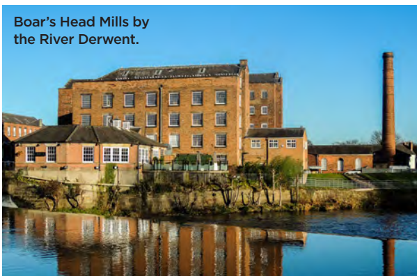
Boar's Head Mills by the River Derwent.

▶ Distance: 7½ miles/12.1km ▶ Time: 3 hours ▶ Grade: Moderate