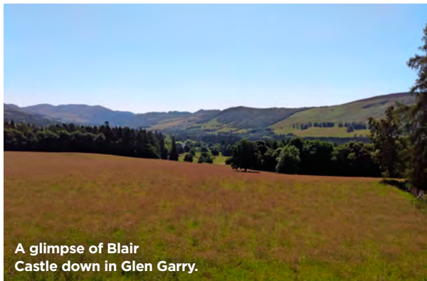
A glimpse of Blair Castle down in Glen Garry.