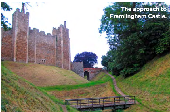
The approach to Framlingham Castle.

▶ Distance: 7¼ miles/11.5km ▶ Time: 3½ hours ▶ Grade: Moderate