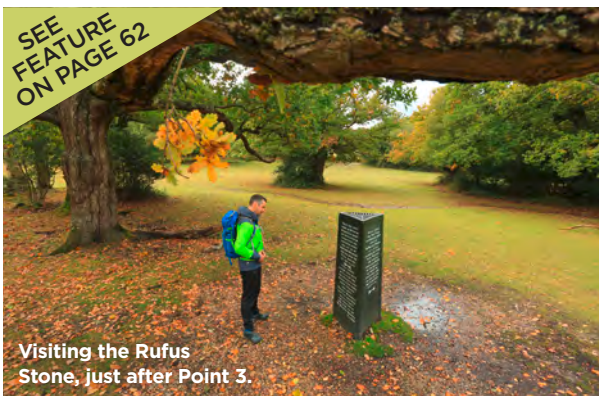
Visiting the Rufus Stone, just after Point 3.

▶ Distance: 7 miles/11.5km ▶ Time: 4½ hours ▶ Grade: Moderate