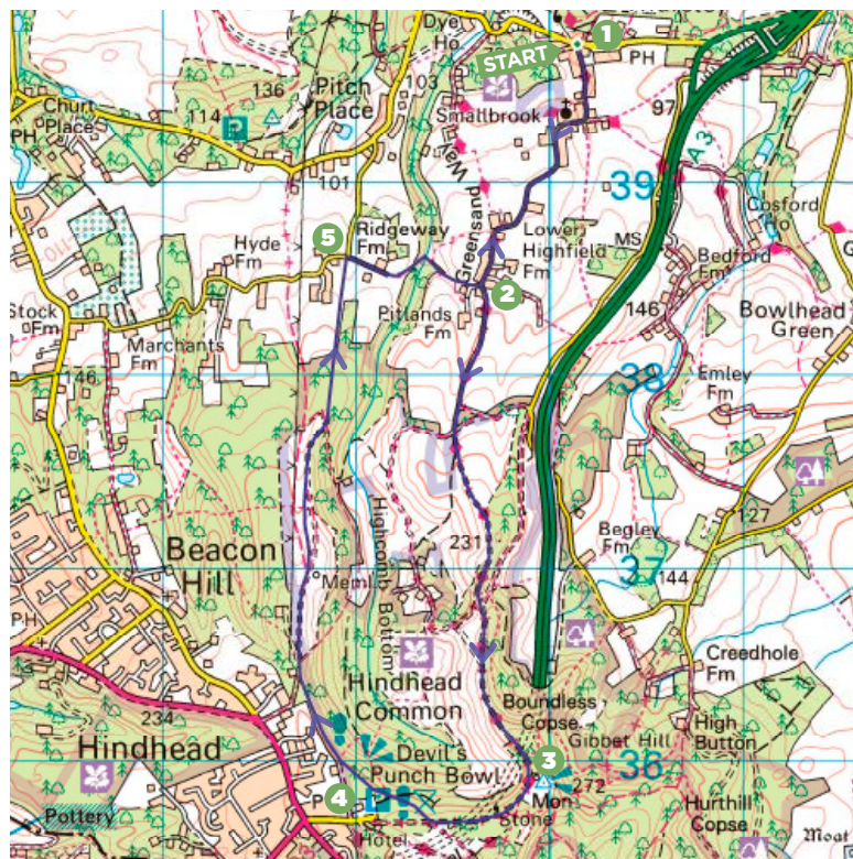
© CROWN COPYRIGHT 2024. ORDNANCE SURVEY. MEDIA 007/24