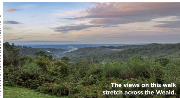
The views on this walk stretch across the Weald.