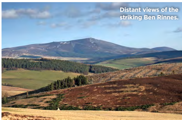
Distant views of the striking Ben Rinnes.