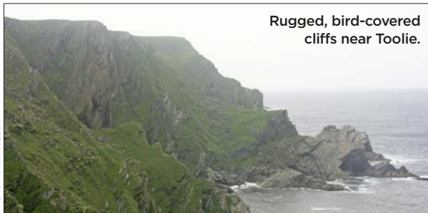
Rugged, bird-covered cliffs near Toolie.

boggy environs. Use duckboards over peat hags. On joining the outward path by the burn, bear L and follow the waymarked route back to the parking area. CW