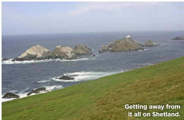
Getting away from it all on Shetland.

▶ Distance: 7.6km/4¾ miles ▶ Time: 3-4 hours ▶ Grade: Challenging