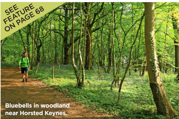
Bluebells in woodland near Horsted Keynes.