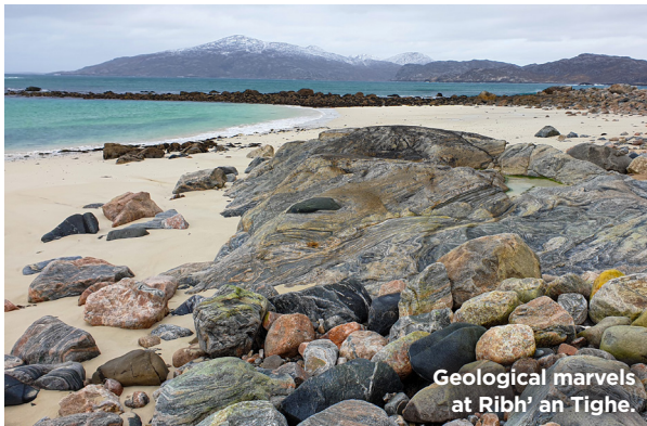
Geological marvels at Ribh' an Tighe.