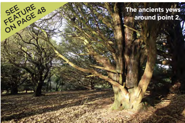
The ancients yews around point 2.