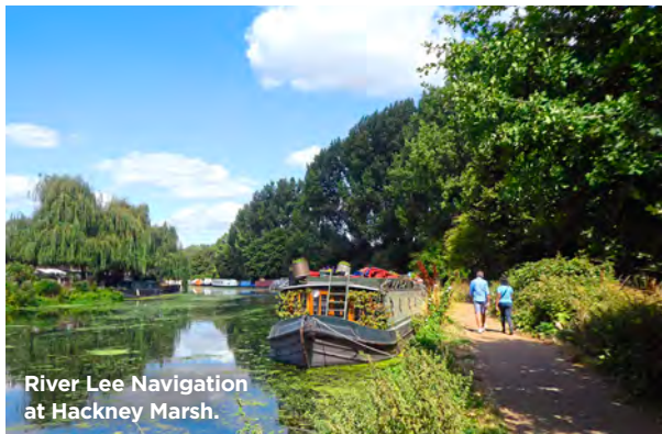
River Lee Navigation at Hackney Marsh.