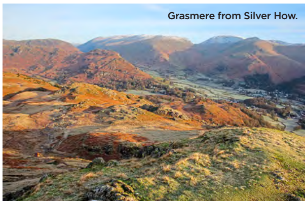
Grasmere from Silver How.