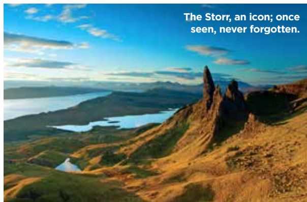
The Storr, an icon; once seen, never forgotten.