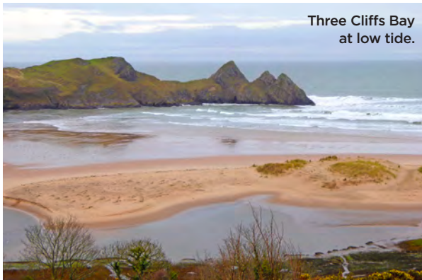
Three Cliffs Bay at low tide.