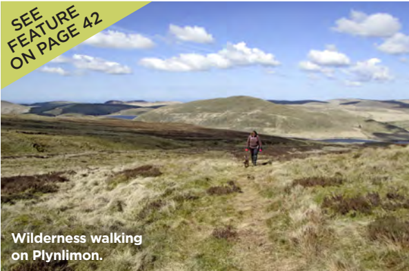
Wilderness walking on Plynlimon.