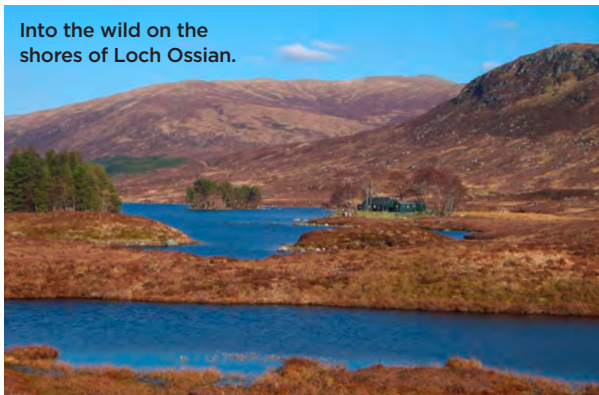
Into the wild on the shores of Loch Ossian.

▶ Distance: 11 miles/ 17.5km ▶ Time: 5 hours ▶ Grade: Moderate