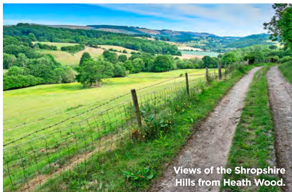
Views of the Shropshire Hills from Heath Wood.

▶ Distance: 7 miles/11.5km ▶ Time: 3 hours ▶ Grade: Moderate