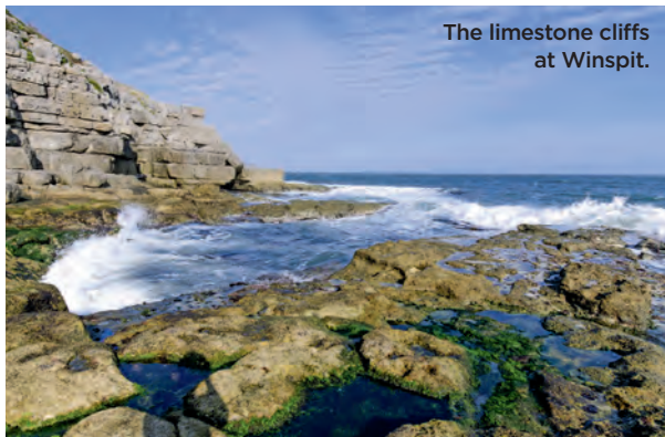
The limestone cliffs at Winspit.

▶ Distance: 6½ miles/10.5km ▶ Time: 3¼ hours ▶ Grade: Moderate