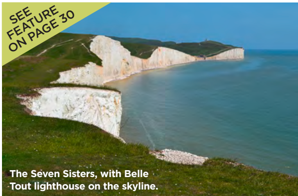
The Seven Sisters, with Belle Tout lighthouse on the skyline.