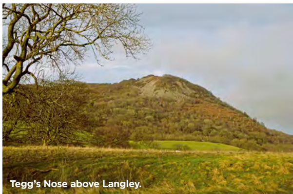
Tegg's Nose above Langley.