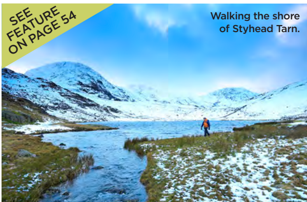
Walking the shore of Styhead Tarn.

▶ Distance: 6 miles/9.65km ▶ Time: 4½ hours ▶ Grade: Moderate