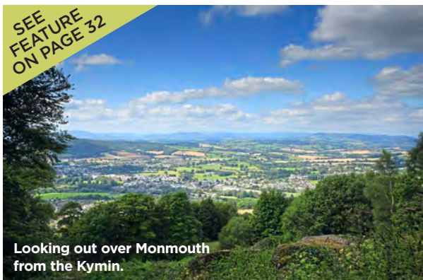
Looking out over Monmouth from the Kymin.