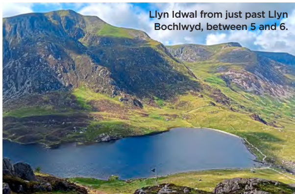
Llyn Idwal from just past Llyn Bochlywd, between 5 and 6.