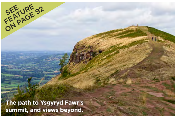
The path to Ysgyrd Fawr's summit, and views beyond.